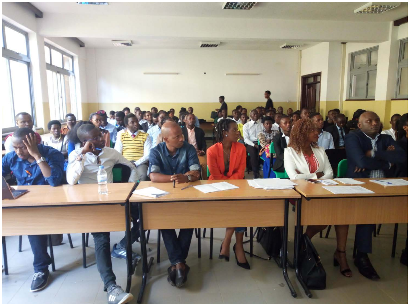
Judges, Organizing Team and students from all colleges of University of Rwanda

The Hult Prize, in partnership with the United Nations, is the world's largest students' competition for budding social entrepreneurs, and every year challenges college and university students to put their time, talent, and innovative ideas towards solving the most pressing global problems, together with their peers. From the tens of thousands of applications received every year, one winning team receives USD 1 million in seed capital, as well as mentorship and advice from the international business community and one team in each Country (which has National program) receives 30,000 US Dollars as start up seed and a chance to compete for the final competition at the United Nations Headquarter after the accelerator in the biggest United Kingdom (UK) business university.