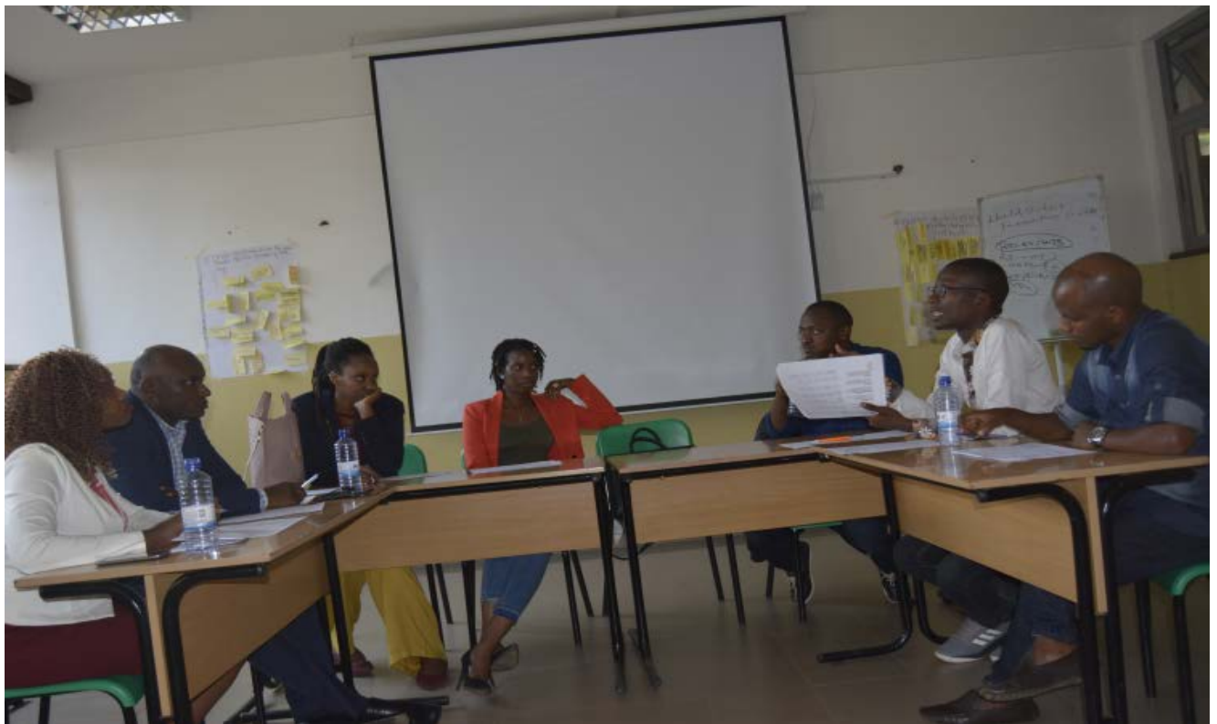
Some judges pictures

We are very much thankful to our judges who helped in selecting of the great ideas, mentoring teams and ensuring they come up with good business ideas. They were from Ministry of youth, Back Home opportunity Network, K-Lab and other companies with expertise in Hult Prize challenge of this year.