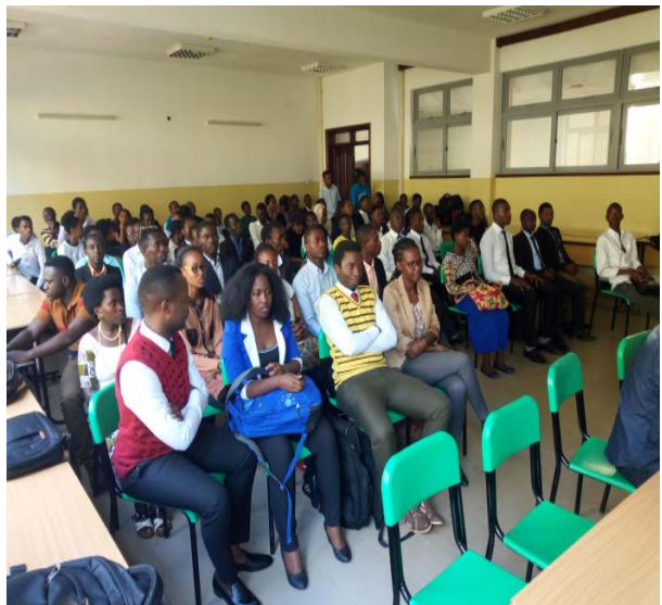
Final Round Pictures