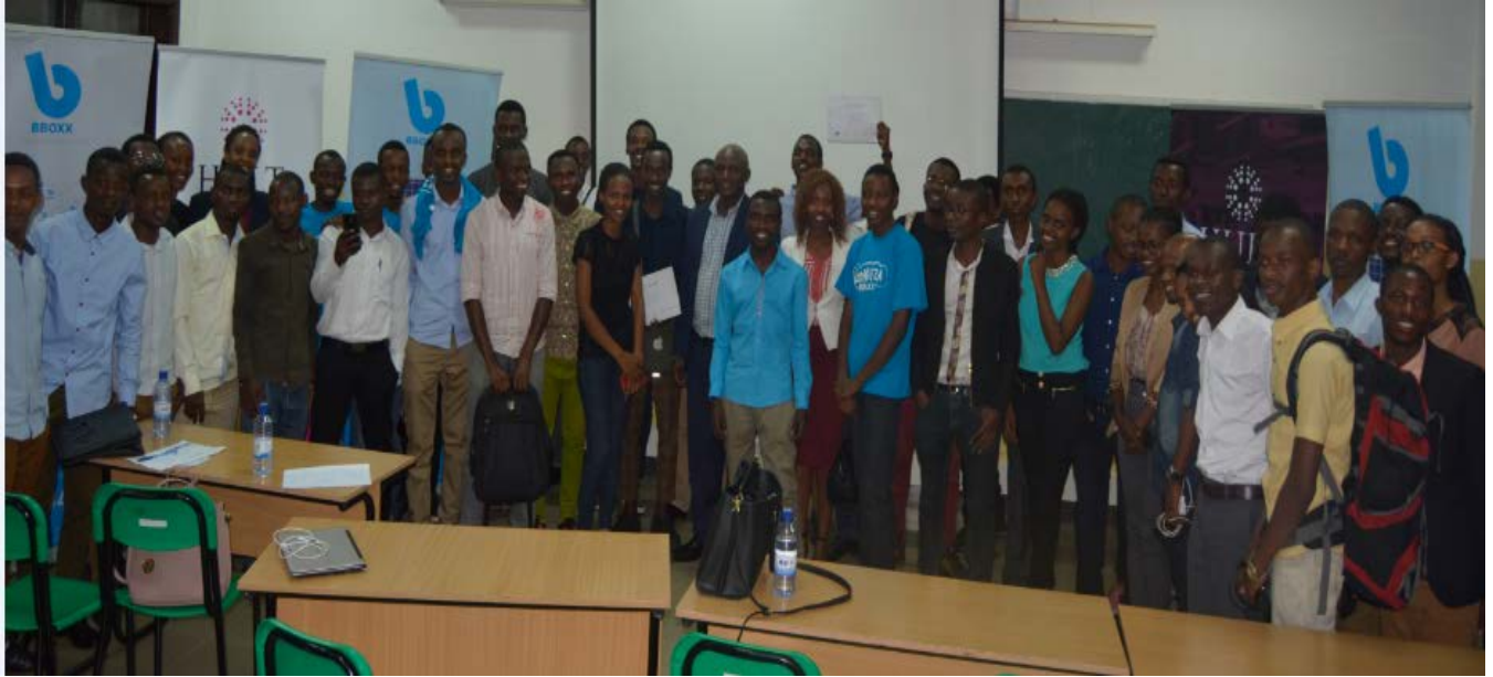
Group Photo (Judges& organizing team)