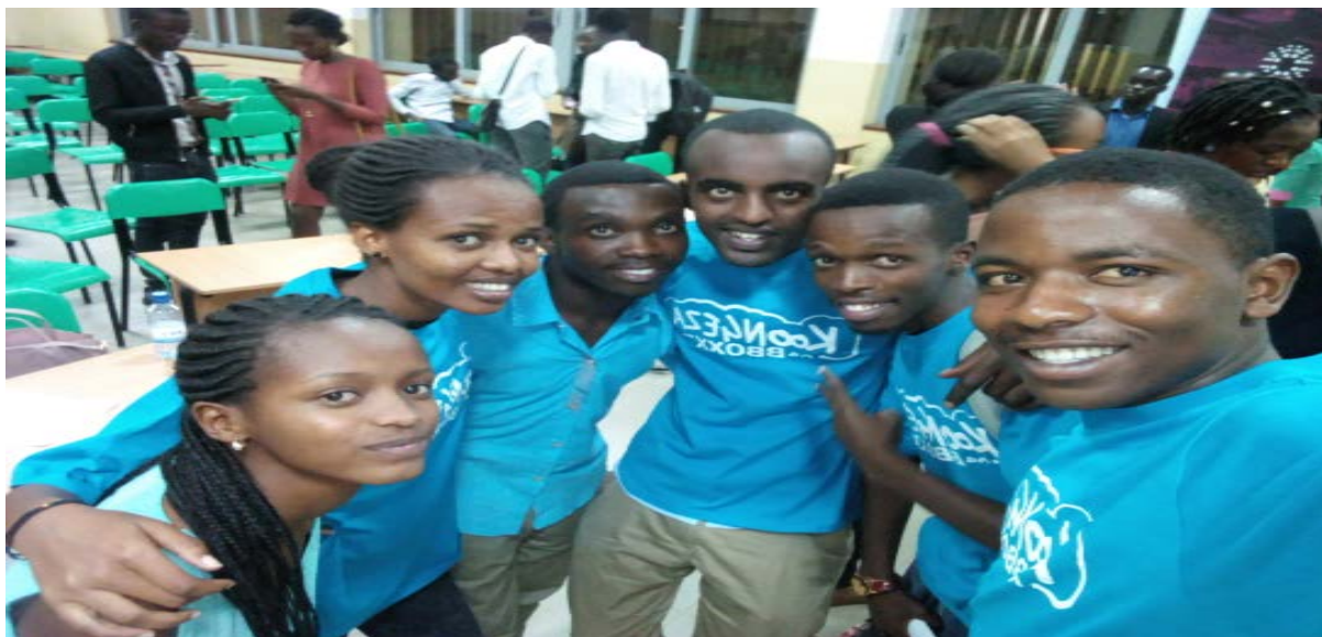
Some Organizing Team Members