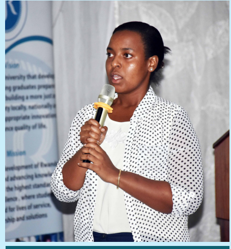
InciSioN contributes to the development of future generations of surgeons, anesthesiologists and obstetricians around the world