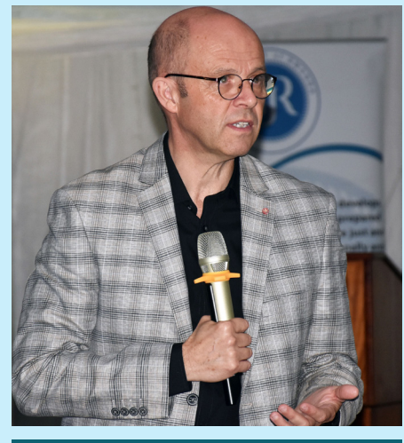
We want to make UR much more compassionate in the way that it deals with students and staff