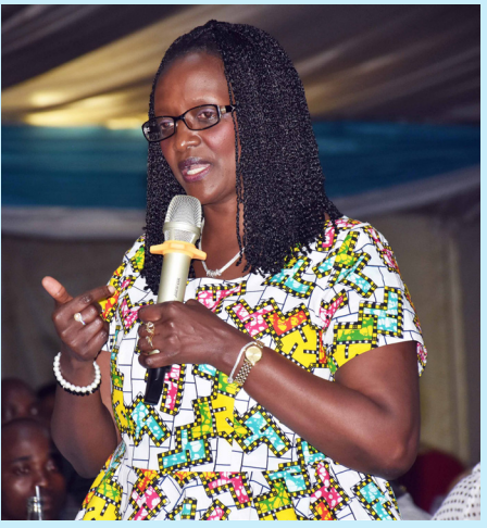
CMHS alone boasts almost a half of the research publication for the entire UR