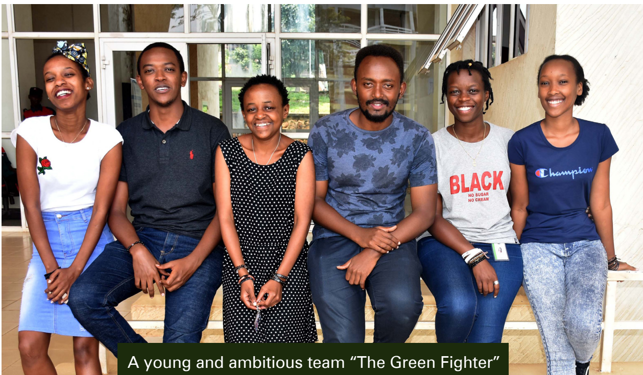
A young and ambitious team “The Green Fighter”

At last, I would like to recall the word of HE Paul Kagame during the youthkonect “To go fast go alone, to go far go together but it is possible to go far and fast altogether.” We don’t have to underestimate the power of unity, team and common vision.